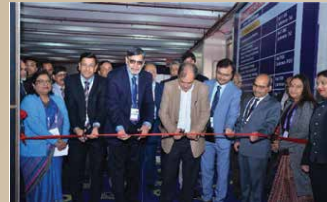
Shri Chaudhary Birender Singh, Hon'ble Minister of Steel, Government of India Inaugurating Metal & Metallurgy in New Delhi