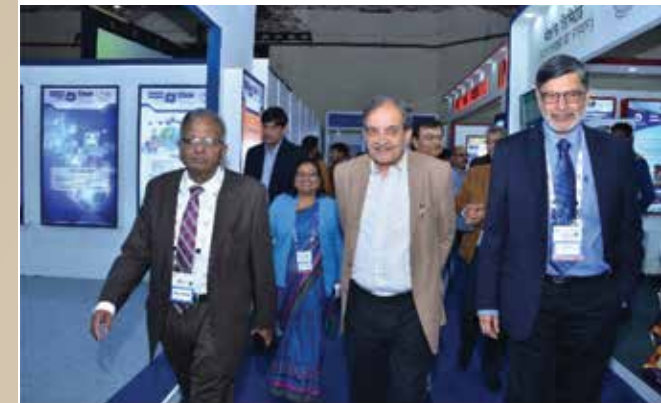
Shri Chaudhary Birender Singh, Hon'ble Minister of Steel, Government of India visiting booth of Metal & Metallurgy